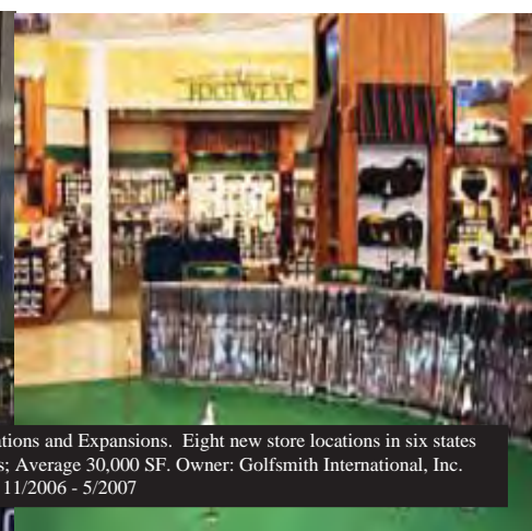
Golfsmith Renovations and Expansions. Eight new store locations in six states over seven months; Average 30,000 SF. Owner: Golfsmith International, Inc. Completion Date: 11/2006 - 5/2007