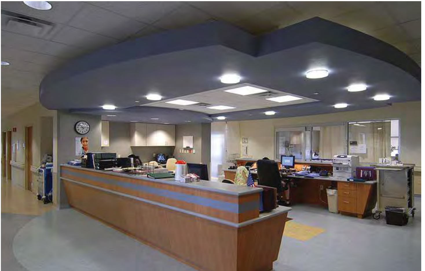
Metroplex Adventist Hospital in Killeen - Three Story Bed Tower Addition This project included a 69,700-SF vertical addition to the Metroplex Adventist Hospital in Killeen, Texas. Owner: Adventist Health System Architect: O'Connell Robertson & Associates Contract Amount: $11,760,915 Completion Date: 3/13/2006