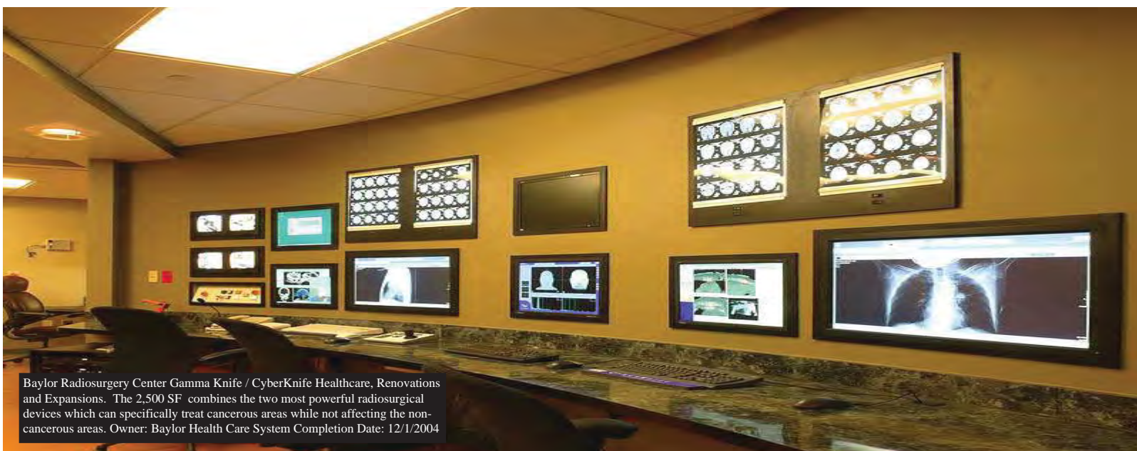
Baylor Radiosurgery Center Gamma Knife / CyberKnife Healthcare, Renovations and Expansions. The 2,500 SF combines the two most powerful radiosurgical devices which can specifically treat cancerous areas while not affecting the non-cancerous areas. Owner: Baylor Health Care System Completion Date: 12/1/2004