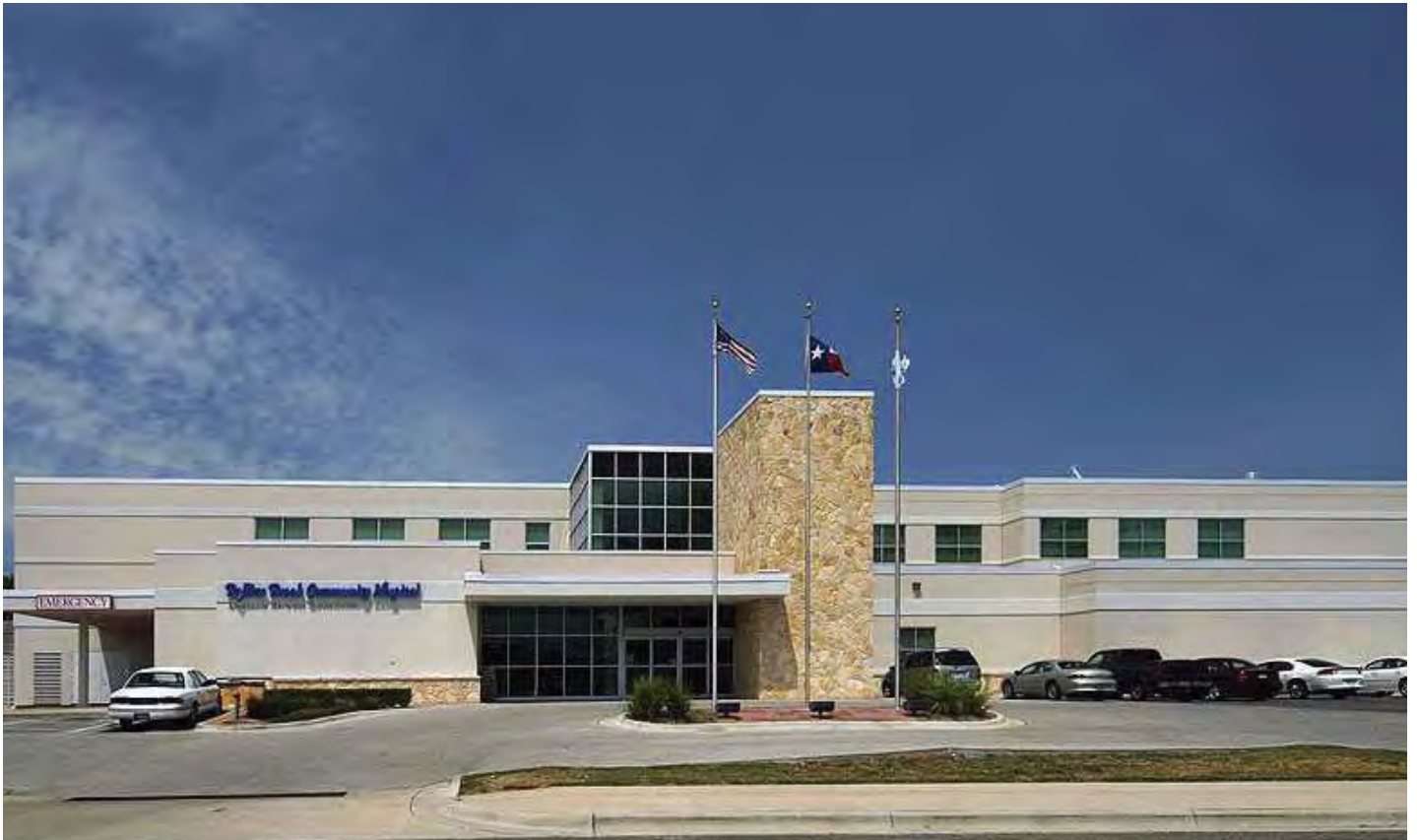
Rollins Brook Community Hospital Healthcare, Renovations and Expansions MEDCO Construction provided preconstruction and construction services for the 14,000 SF expansion to this existing hospital that included two new operating rooms and 17 patient beds. Owner: Adventist Health System, Architect: O'Connell Robertson & Associates Contract Amount: $3,592,277 Completion Date: 11/15/2005