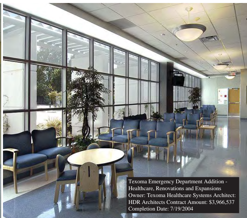
Texoma Emergency Department Addition - Healthcare, Renovations and Expansions Owner: Texoma Healthcare Systems Architect: HDR Architects Contract Amount: $3,966,537 Completion Date: 7/19/2004